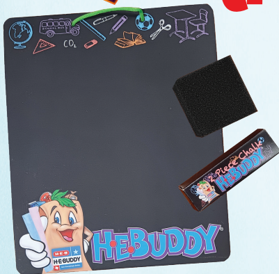
H•E•Buddy™ Chalkboard COLLECT 300 POINTS!