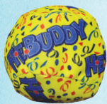
H•E•Buddy™ WATER Ball INSTANT WIN PRIZE!